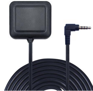
Figure:GGM-5546-MT4WDC300 Top View