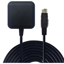
Figure: GRM-3636F2W-AG Top View