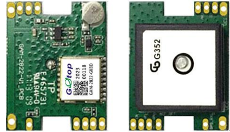
Figure : GAM-2822-GKBD Top View