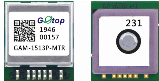
Figure1: GAM-1513P-MTR Top View