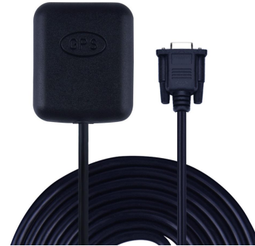
Figure : GRM-4538-MTRDB9P200 Top View