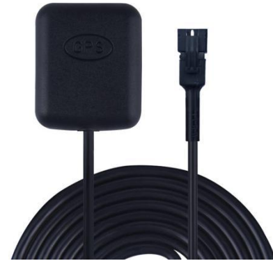
Figure : GGM-4538-MTR3P050 Top View