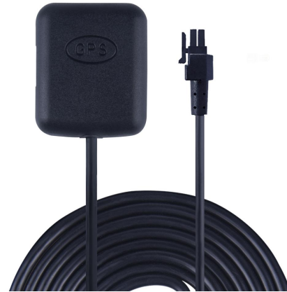
Figure : GGM-4538-GKBD Top View