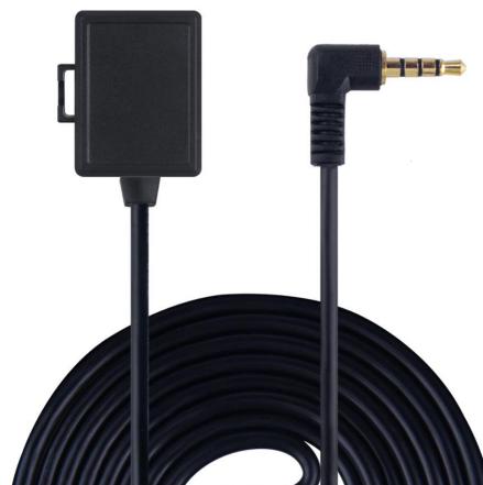
Figure1:GGM-3325-MTR Top View