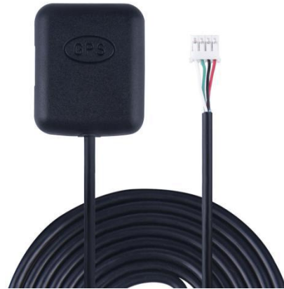
Figure : GGM-4538-GK Top View