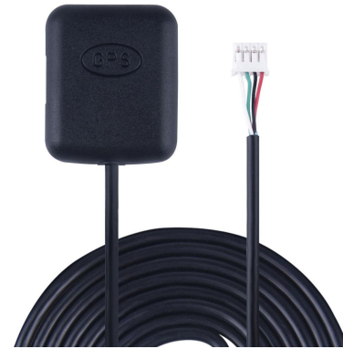
Figure : GGM-4538-HD Top View