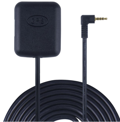
Figure : GGM-4538-MT Top View