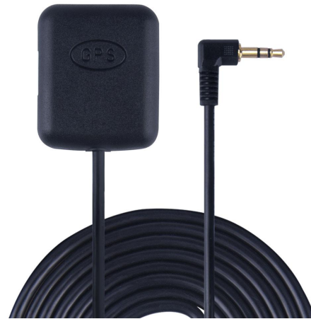
Figure : GGM-4538-MTR Top View