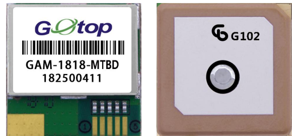
Figure1: GAM-1818-MTBD Top View