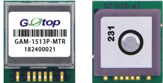
Figure1: GAM-1513P-MTR Top View