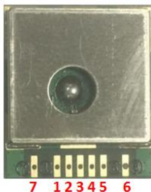
Figure 2: Pin Assignment