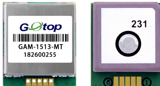
Figure1: GAM-1513-MT Top View