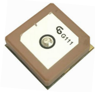
Figure1: GAM-1818-MTR Top View