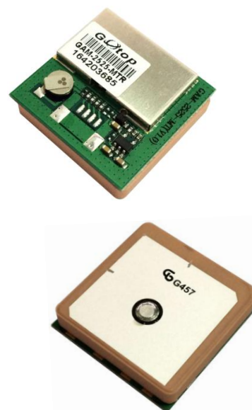
Figure1: GAM-2525-MTR Top View