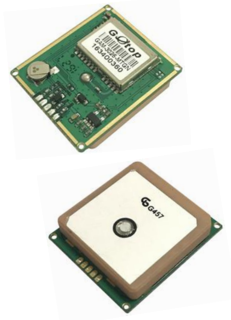
Figure1: GAM-3026-MTGN Top View